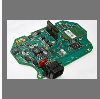
Embedded Control Systems