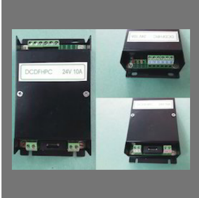
DCDFHPC DC Drive