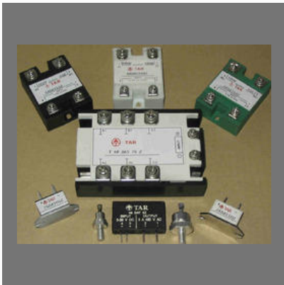
Solid State Relay