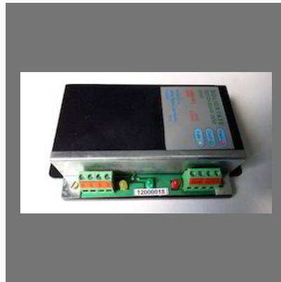
Clutch Brake Drive Cbd003