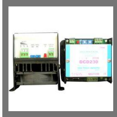
DC Motor Drive