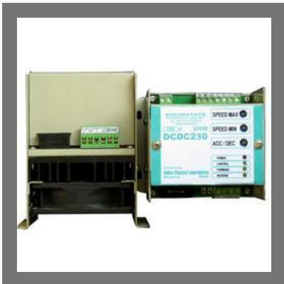
Electric DC Drive