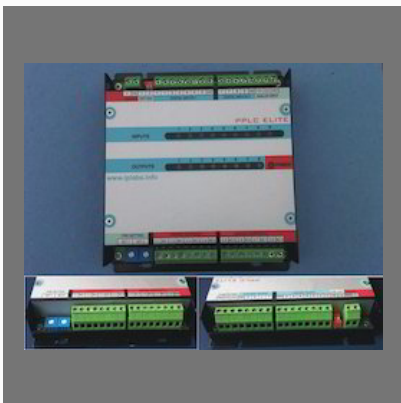
Pre Programmed Logic Controllers PPLC Elite