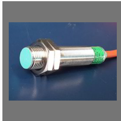
Magnetic Pickup Sensor / Speed Sensor