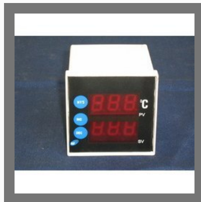
Digital Temperature Controller