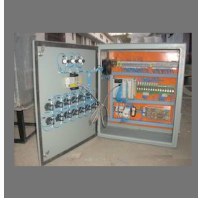
Programmable Logic Controller