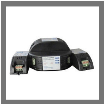
Clutch Brake Drive